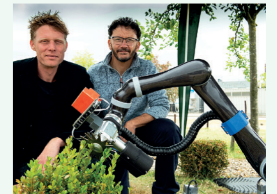
Proud parents: TrimBot navigates the test garden

Van de Zedde is now setting up the Netherlands Plant Eco-Phenotyping Centre to continue this work, a €22m joint WUR and University of Utrecht project aimed at keeping the Dutch at the forefront of horticultural practice. We are probably some decades away from dispensing with the human workforce in horticultural crops altogether, but task by task, automation is transforming the business. ●