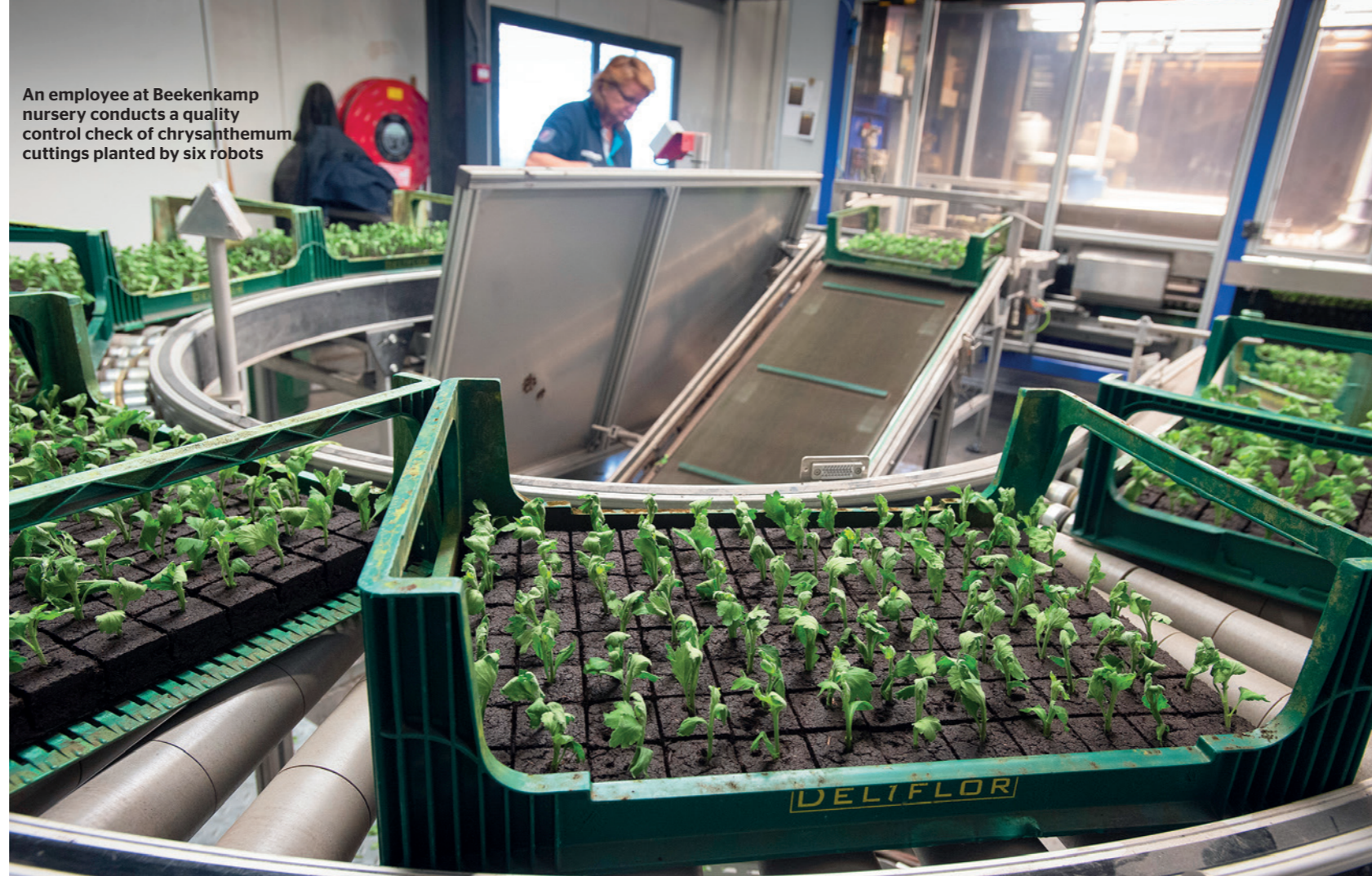
An employee at Beekenkamp nursery conducts a quality control check of chrysanthemum cuttings planted by six robots

Robots are also transforming the way that plants are grown long before they are harvested for commercial use. It is probably in plant breeding that robotics technology will ultimately have the greatest impact. The phenotype of a plant – what it looks like and how it performs – is the result of the interaction of its genes