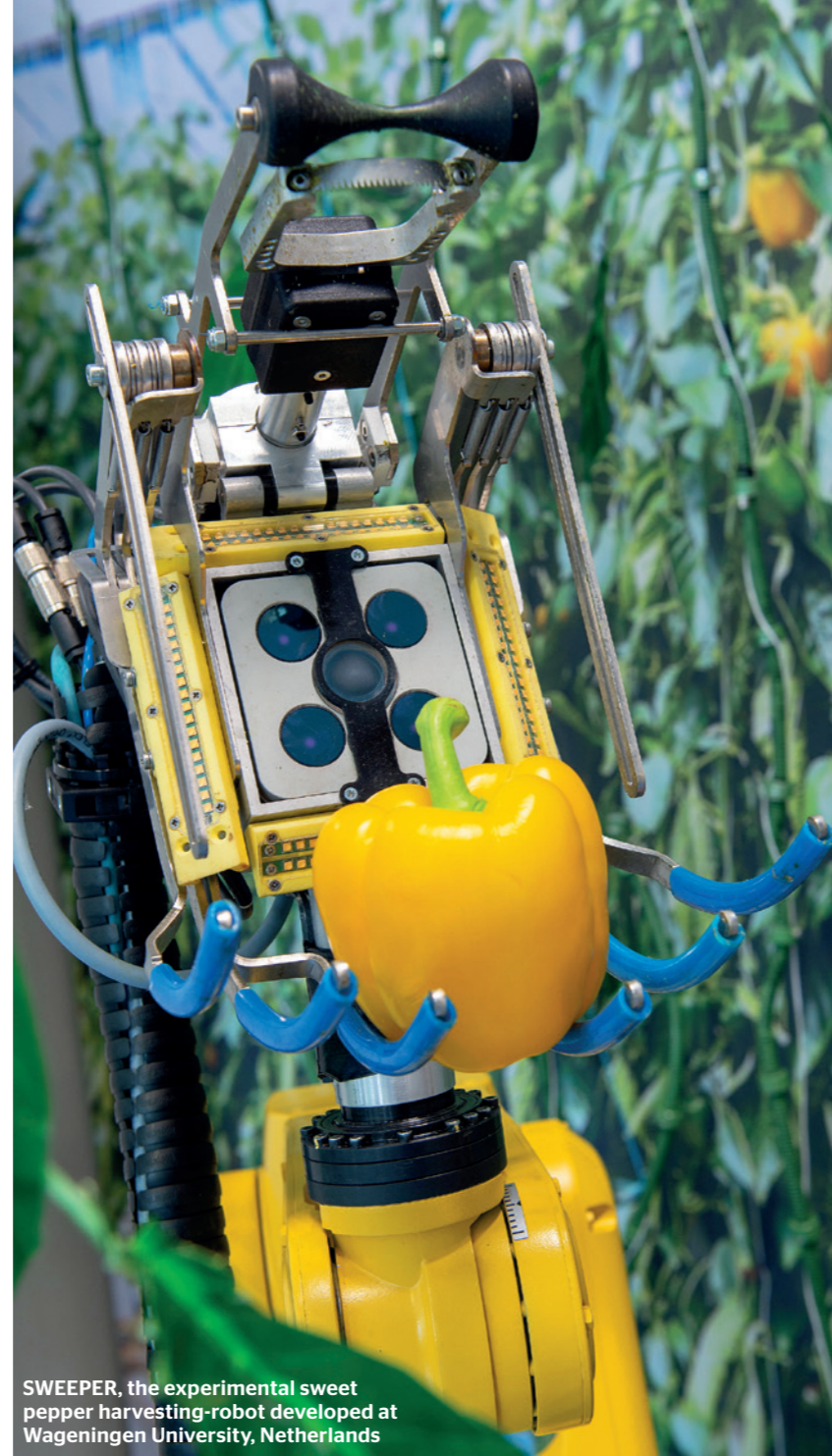
SWEEPER, the experimental sweet pepper harvesting-robot developed at Wageningen University, Netherlands

While robots are already hard at work transplanting young plants in the commercial world, academic