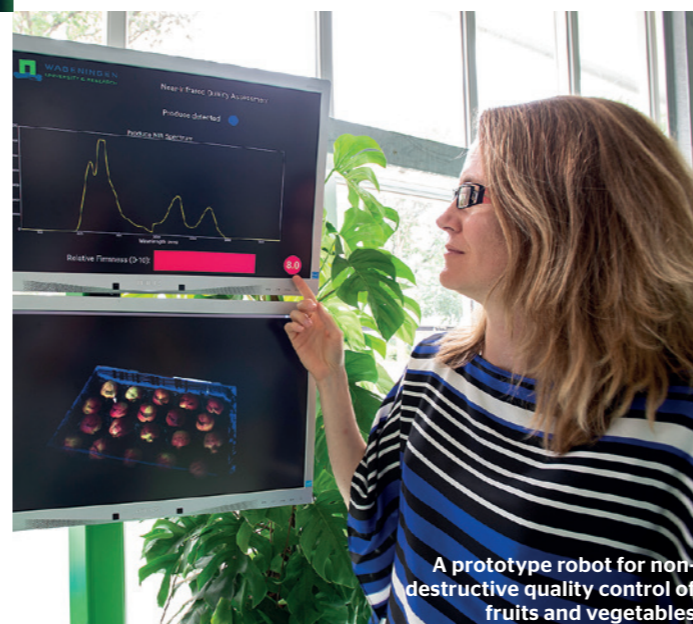
A prototype robot for non-destructive quality control of fruits and vegetables

One of WUR's developments, the result of three years of research, is SWEEPER, the first sweet pepper harvesting-robot designed to work in commercial greenhouses. SWEEPER's cameras scan the bottom of the pepper for a colour indication of ripeness and maturity, before cutting the stem and dropping the fruit into a waiting robotic hand. The prototype system is still some way from commercial use as it takes about 24 seconds to harvest one pepper and currently only works well on yellow-coloured varieties where there is