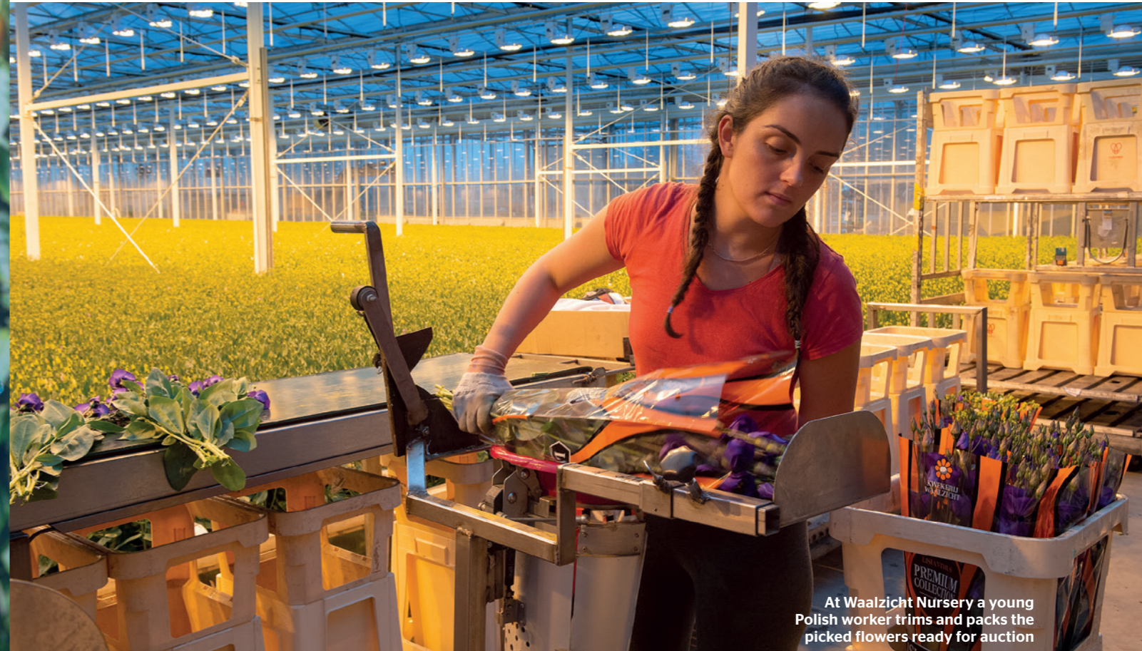
At Waalzicht Nursery a young Polish worker trims and packs the picked flowers ready for auction

The robots are dealing with living things - pick up a cutting or a fruit with too great a pressure and the living tissue may be fatally crushed